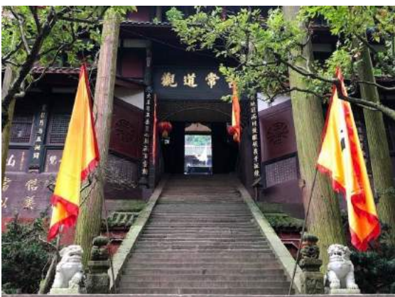
Entrance Daoist Temple