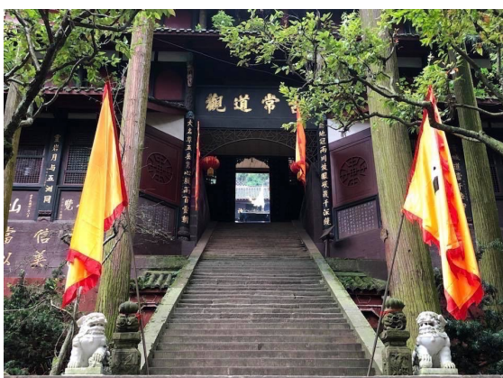
Entrance Daoist Temple